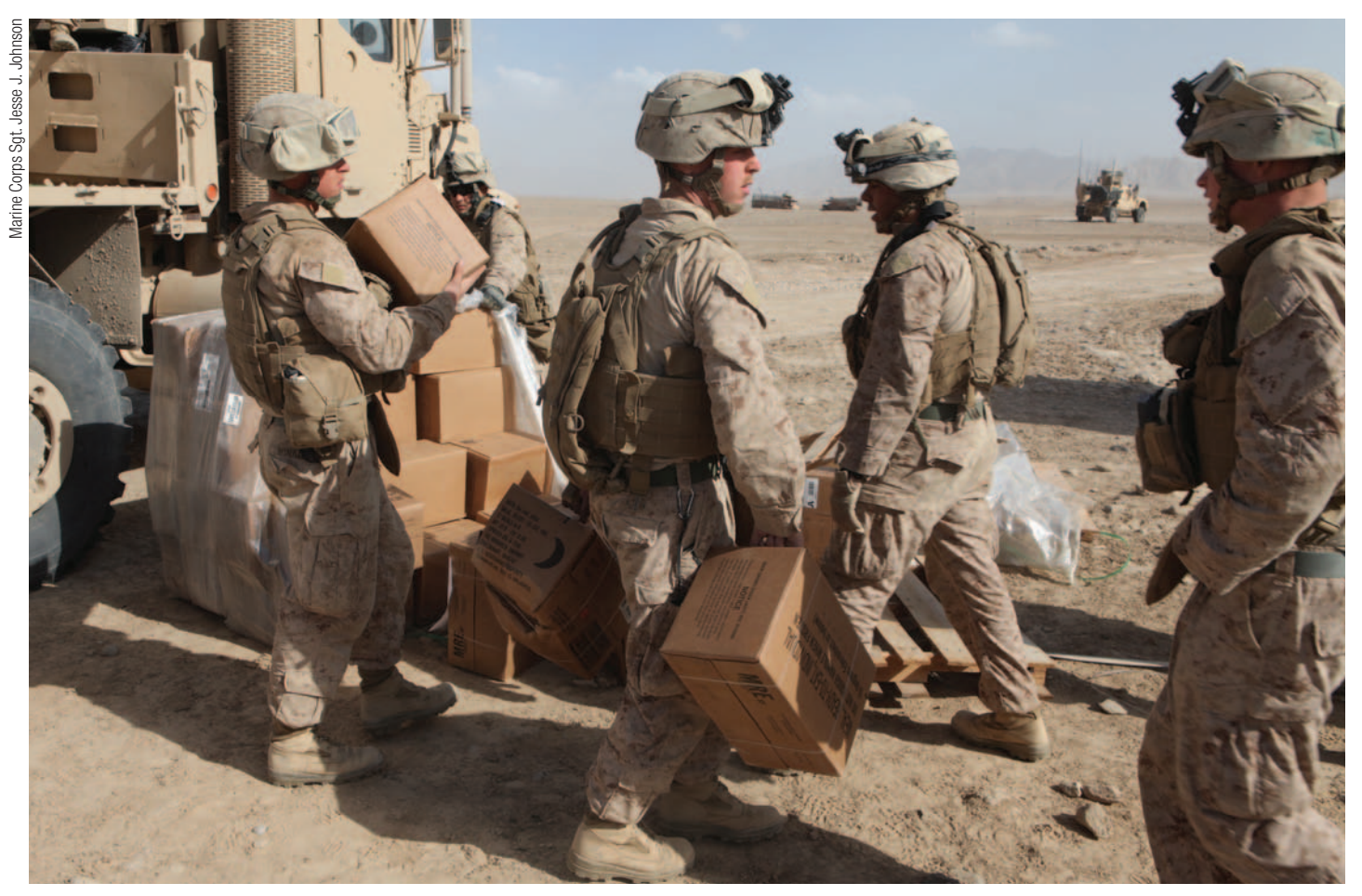
U.S. Marines unload pallets of meals ready to eat during a resupply to their patrol base near Combat Outpost Ouellette in Helmand province, Afghanistan. A DLA Troop Support subsistence team was recently recognized for their efforts in implementing the Common Food Management System, which will improve the way food for warfighters is ordered.

worked on the CFMS Standardization Team.